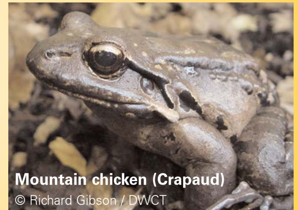
Mountain chicken (Crapaud)